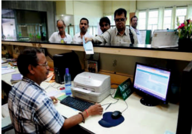
Inside a Bank