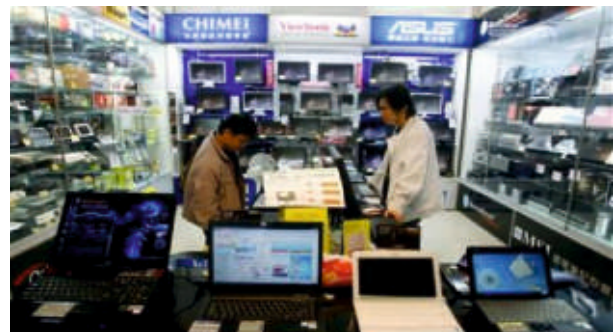
In a Shop