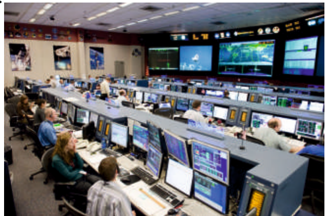
Inside Space Research Centre